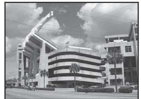
Figure 3: University of South Carolina.