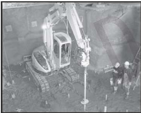
Figure 1: Helical Foundation Installation.

The International Code Council (ICC) voted unanimously in June 2007 to adopt AC358 Acceptance Criteria for Helical Foundations and Devices. These new criteria establish a much-needed standard for evaluation of helical piers and foundation brackets. AC358 takes into account not only pier material strengths, but also connections to structures, buckling, corrosion, and soil interaction. Ultimately, the improved evaluation reports resulting from AC358 will standardize capacities, give more confidence to engineers and building officials, and improve manufacturing quality assurance.