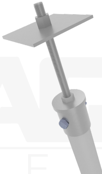
Bearing Plate & Washers Sold Separately

Notes: Cap capacity is developed using the ASD design method and considers strength of collar, end effector, and pile connection. Capacity may be limited by the helical pile itself, bearing/pullout capacity of soil, or strength of the structure to which the cap is attached.